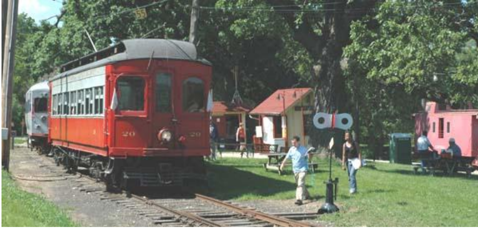
WTTW Producer Dan Protes is shown here with Car 20 shortly before its departure to Blackhawk station in the Jon Duerr Forest Preserve.