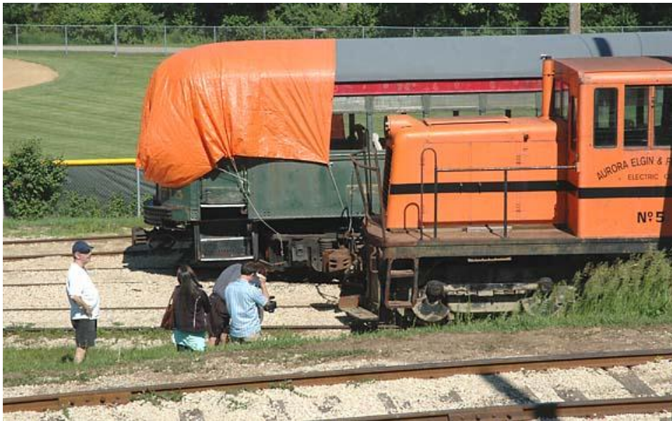
AE&FRE No. 5, part of the museum's historic collection, captured the interest of the WTTW filming crew.