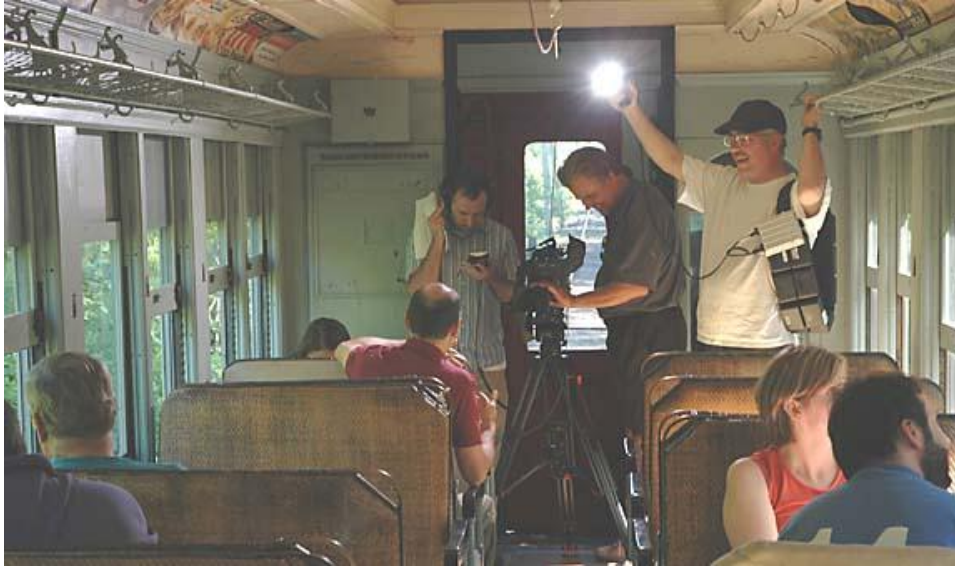
WTTW crew filming CA&E 20's "extras" (South Elgin residents and FRTM members) en route to Blackhawk. South Elgin Parks & Recreation Department did a good "casting" job on short notice.