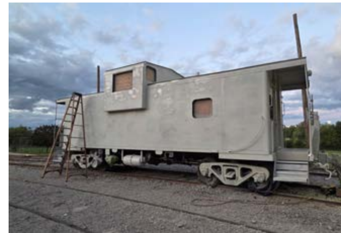
Here's a look at the "before" photo, as S00 Caboose 117 is carefully prepped for a fresh coat of paint.

tired from service in May 2023 before being acquired by Maggio Towing and Trucking and subsequently donated to the museum. After its arrival in October 2023, it remained on museum property until early 2025, when restoration work began. Caboose #117