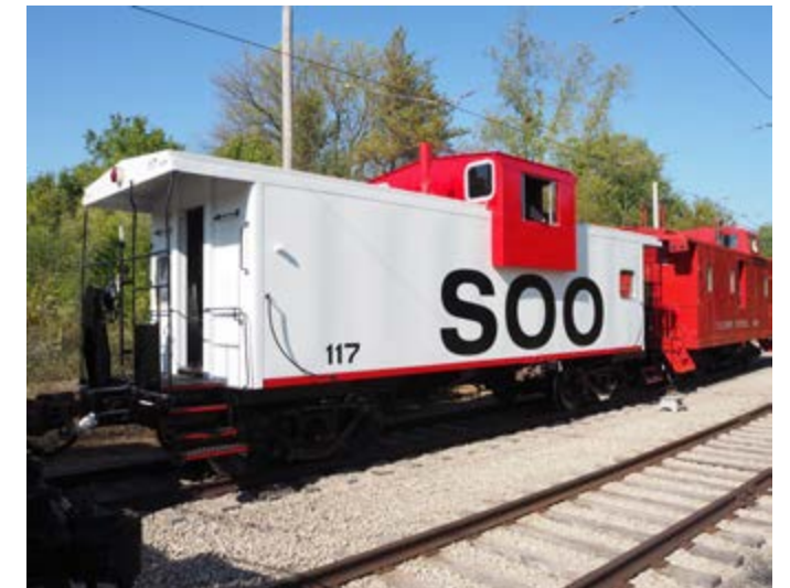
A fresh paint scheme, new to the museum but true to the car's original appearance, has now been beautifully applied.

made its first run at the end of the 2025 season and also made a cameo appearance in the caboose train during Members Day. The caboose will continue to educate the public on the railroad histo-