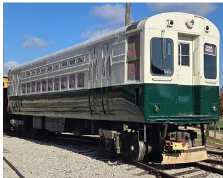
CTA Car 45 after a fresh coat of paint